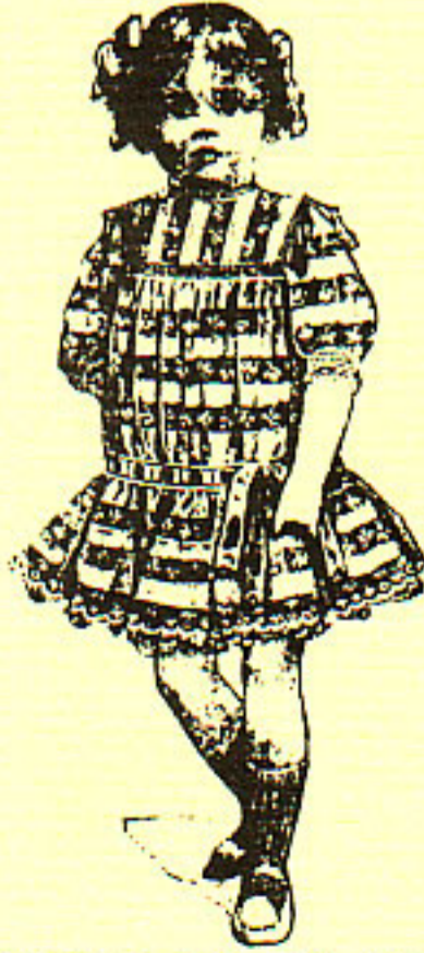
F6713.—Pretty Style, White Muslin Frock. Trimmed imitation Val Lace Threaded Ribbon at Waist. 19 in., 8/11 \frac{1}{2} , 21 in., 9/11 \frac{1}{2} , 23 in., 10/11.