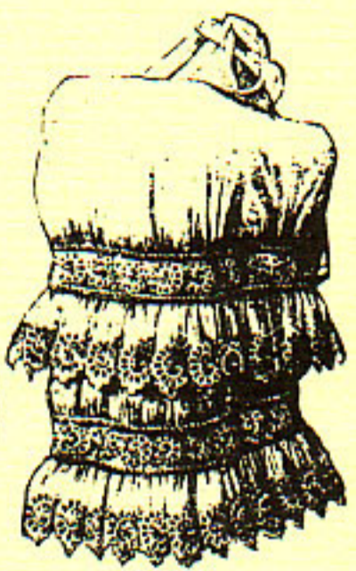
U5314.— Longcloth Knickers, trimmed effective em- broidery and feathering. Price 2/11 \frac{1}{2}