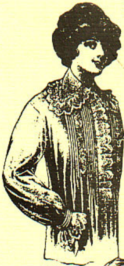
U5211.— Long- cloth Nightdress, turn-down collar, trimmed Embroidery & Insertion. Good value. Price 2/11 \frac{1}{2}