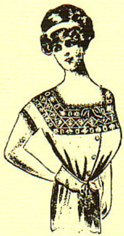
U5313.—Special Line, Smart Camisole, with lace yoke. Price 1/0 \frac{1}{2}

Dainty . . . Knickers . . . Chemises . . . . . . and . . . Camisoles, Newest . . . Designs . . .