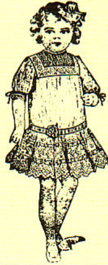
F6714.—Dainty Muslin Frock. Trimmed Embroidery and Valenciennes Lace Threaded Ribbon. 19 in., 6/11 \frac{1}{2} , 21 in., 7/6 \frac{1}{2} , 23 in., 7/11 \frac{1}{2} .