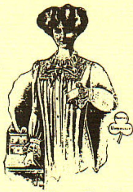
U5213.—Long- cloth Nightdress, good useful style, Collar trimmed Em- broidery also down front with small tucks. Price 3/11 \frac{1}{2} .