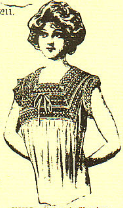
U5317.—Nainsook Chemises, trimmed lace and insertion, ex- ceedingly effective style. Special price, 1/11 \frac{1}{2}

LADIES' BUST BODICES AND BUST IMPROVERS, Price, 1/11 \frac{1}{2} , 2/11 \frac{1}{2} , 3/6 \frac{1}{2} .