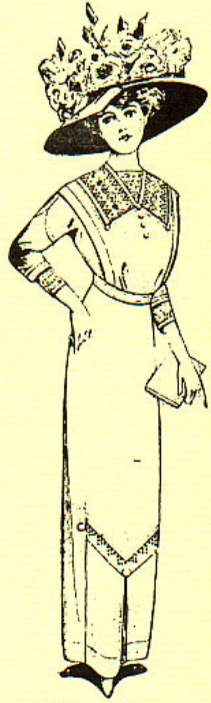
B4172.—5/11 \frac{1}{2} Case ment Sate. Bodice with Embroidered Reverses and lace vest. Set in Sleeve finished with Lace Cuff, Skirt with Tabs of Em- broidery front and back.