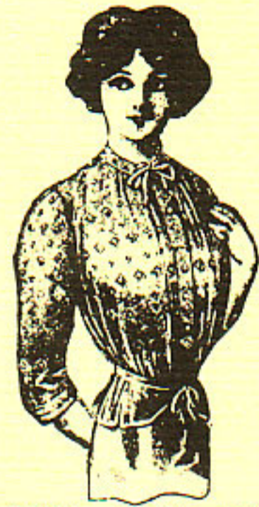
U5312.— Dainty and Useful Embroidery Camisole, High Neck, three-quarter sleeve. Price 2/9 \frac{1}{2}

Dainty . . . Knickers . . . Chemises . . . . . . and . . . Camisoles, Newest . . . Designs . . .